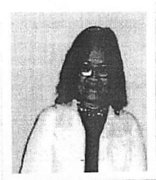
Dean of Faculty of Nursing, Khon Kaen University, Thailand

As founder, network coordinator and co-host for 2014's installment, we will continue our mission of urging nursing institutions to educate and nurture students with the purpose of making a difference in the health arena. In closing, we are thrilled to join in with the welcoming of all potential and confirmed participants to this year's INSF to be held at the Kapuas Palace Hotel, Pontianak to be expertly hosted by the Institute of Nursing, Pontianak, West Borneo, Indonesia.